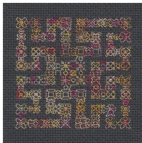
This model stitched using Threadnuts Painter's Threads 6-strand cotton floss, in Macke. (Stitched using 1 strand.)

Fabric is Wicht Aida Chalk Board Black (14 count)