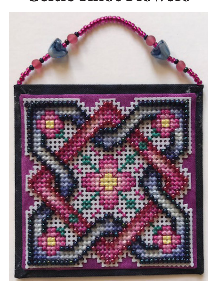
By Frony Ritter Designs